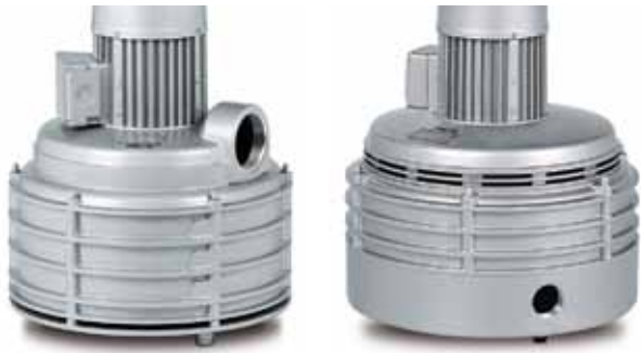
F-CEV-S / F-CEV-D