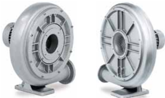
F-RER / F-REL