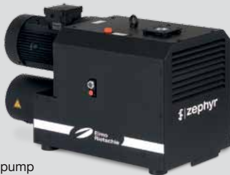
VLR-301 Vacuum pump